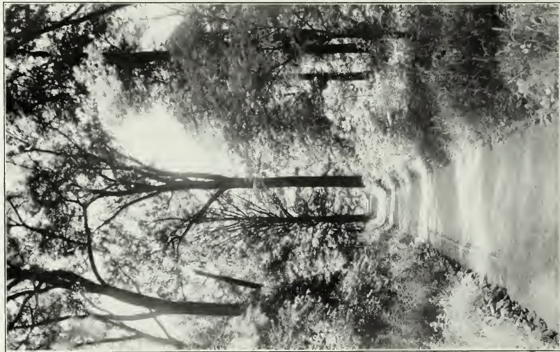
A RESTFUL WALK WHEN THE DAY IS DONE